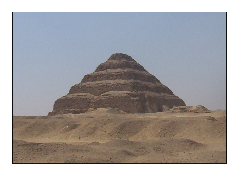
Figure 1 . The stepped pyramid of Djoser at Saqqara.

In addition, a great deal of cost was involved in pyramid building on the scale that we see, not only in the Saqqara complex, but also in the Giza and other pyramids that followed. According to the biblical story, the pharaoh became enormously wealthy from sale of the grain gathered during the seven plentiful years to both his people and to those who came from foreign countries to buy (such as Joseph's brothers, noted in Gen. 42–43). The ongoing 1/5 income tax that Joseph instituted would also have continued to pour money into the pharaoh's coffers year after year (Gen. 47:26). The sudden available wealth displayed in Djoser's reign by his building program fits the biblical account well if Joseph was Imhotep.