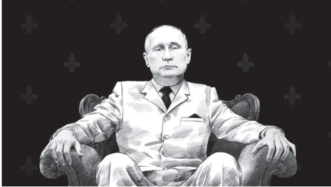
saying about their own country, in Russian.

I just don't understand why English-language commentary (all non-Russian commentary, actually) is so far removed from what patriotic Russians living in Russia are