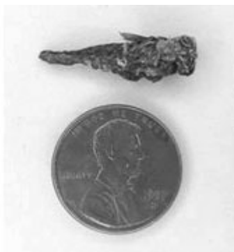
Figure 2 Mummified Rocky Mountain Locust collected from glacial deposit.

Now, over 135 years later, we learn the rest of the story. The locusts are extinct, and for all practical purposes, the prairie that once covered over 250 million acres of the central U.S. is almost gone as well. In Minnesota (18 million acres original prairie, 12,000 acres remain) and Iowa (30 million original prairie acres, 20,000 acres remain), less than one percent of what once was still remains. Just as we can find glacial remains of the locust (Figure 2), we can also find postage-stamp remnants of this greatly endangered ecosystem. Numerous local, state, and federal agencies are investing millions of dollars to restore and reconstruct the pre-settlement prairie. These remnants often contain 100 or more species of plants and another order-of-magnitude of other organisms that are dependent on this ecosystem.