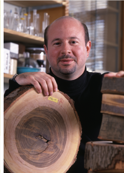
Cause for controversy: Michael Mann used proxies for climate change, such as tree rings, to produce a picture of Earth's changing climate over the past millennium.